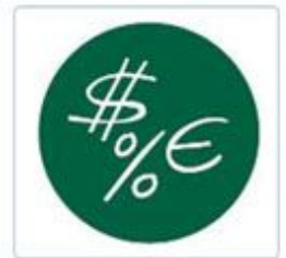
BUSINESS ENTREPRENEURSHIP PATHWAY