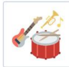
MIDDLE & HIGH SCHOOL MUSIC