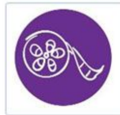
VISUAL ARTS & TECHNOLOGY PATHWAY