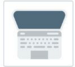
1 TO 1 CHROMEBOOKS