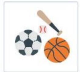
MIDDLE & HIGH SCHOOL ATHLETICS